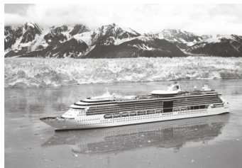
Balcony cabin w/air from Portland

Ocean View cabin w/air from Boston $1837.86pp